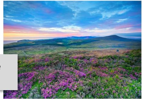
"Evening Light on Cronk Ny Arrey Laa"